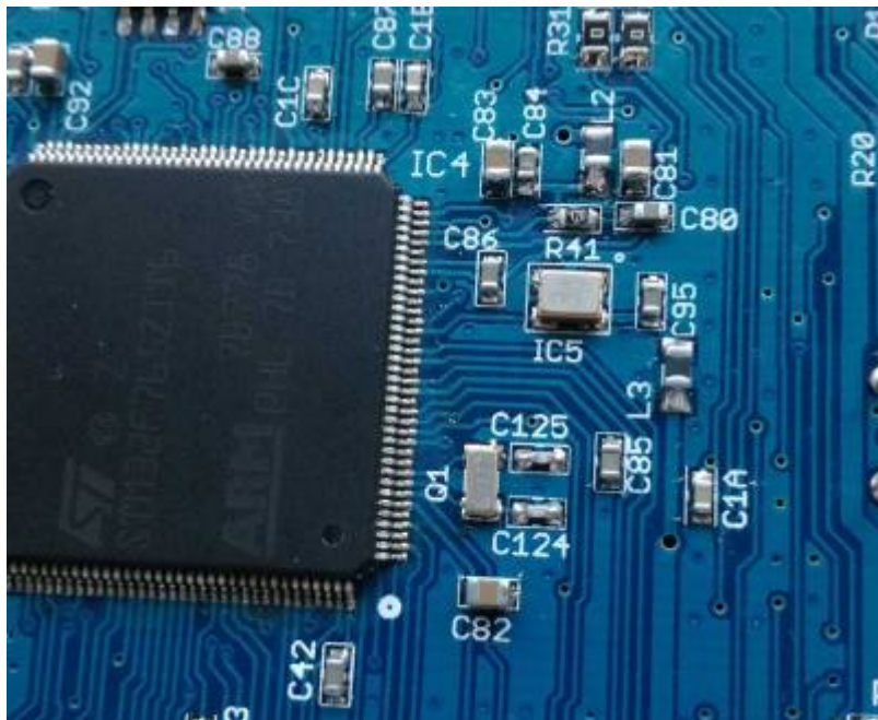
Orientation of TXCO & MCU (photo DF9EH)