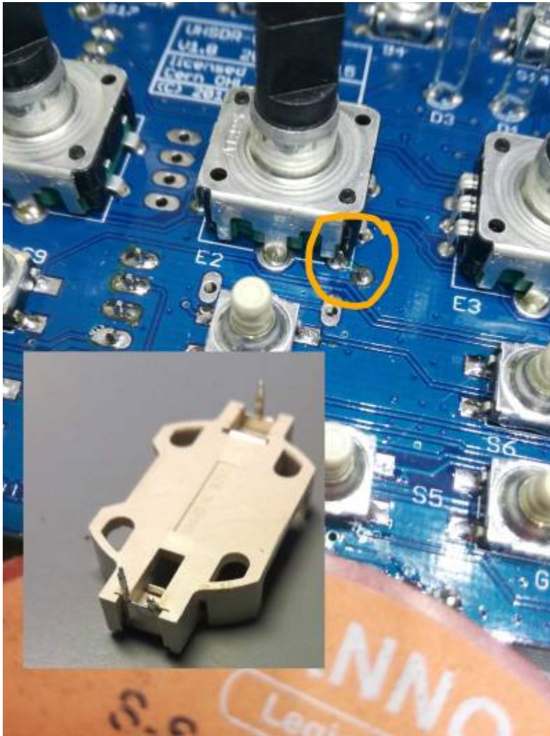
Potential Shortcut (photo DF9EH)

Make sure to cut this pin flush with PCB surface before soldering - see photo: