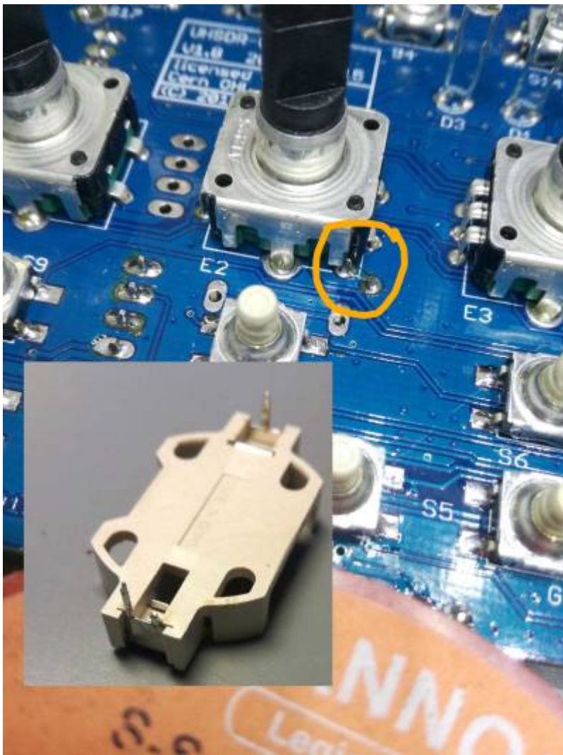
Potential Shortcut (photo DF9EH)

Make sure to cut this pin flush with PCB surface before soldering - see photo: