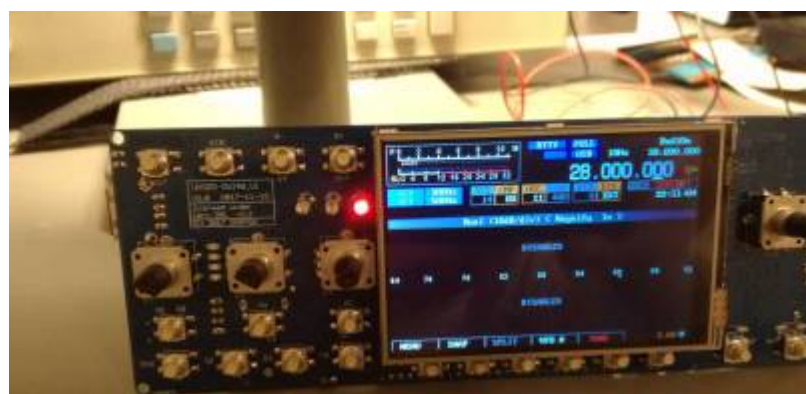
OVI40 UI and display board